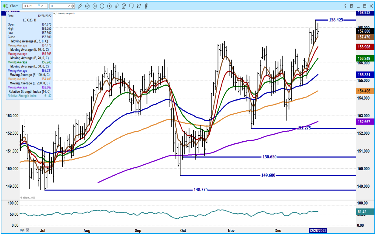
FEBRUARY 2022 LIVE CATTLE – VOLUME AT 17,101 RESISTANCE AT 158.50 SUPPORT AT 157.50 TO 156.25