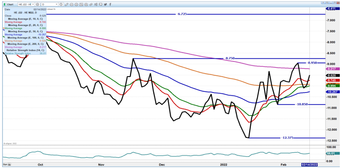
APRIL/JUNE LEAN HOG SPREAD – APRIL GAINING ON JUNE. LOOK FOR FURTHER GAIN