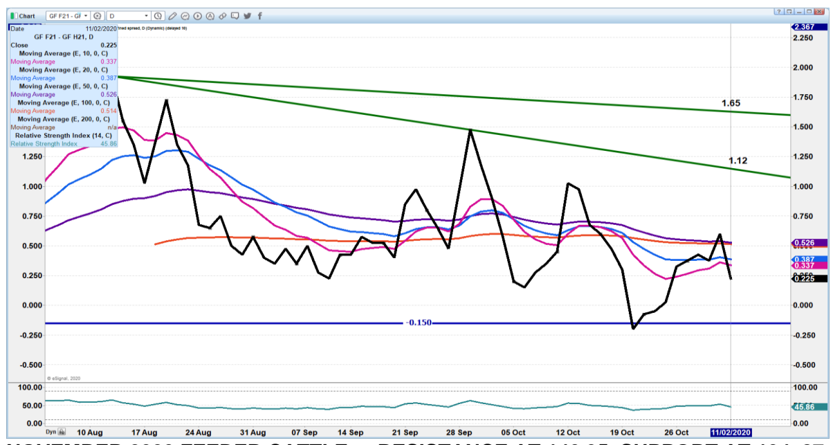
NOVEMBER 2020 FEEDER CATTLE - RESISTANCE AT 140.35 SUPPORT AT 134.87