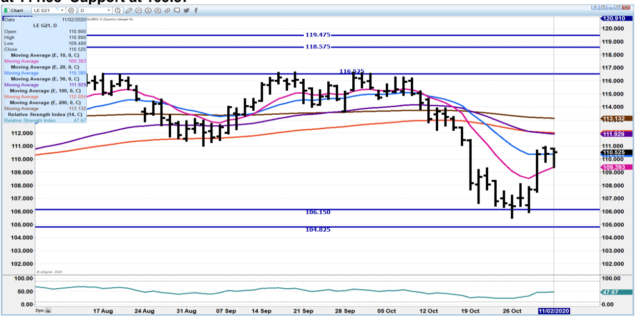
APRIL 2021 LIVE CATTLE – Resistance at 114.37 Support at 112.45